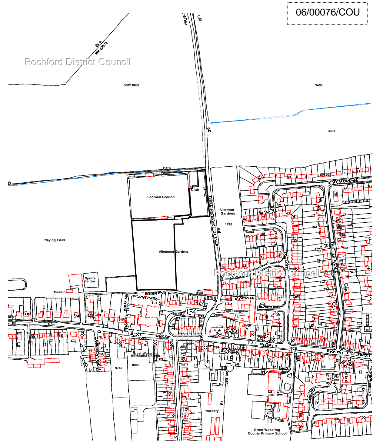
Rochford District Council