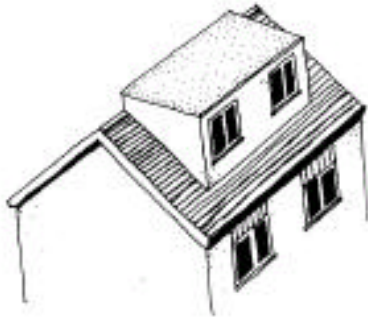
UNATTRACTIVE FLAT ROOFED DORMER