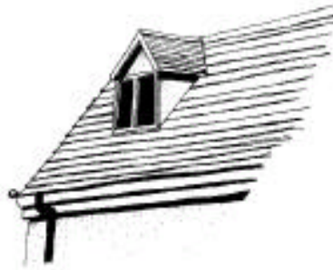
WELL DESIGNED DORMER