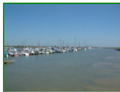
RDCLDS (2005-2007) - 4