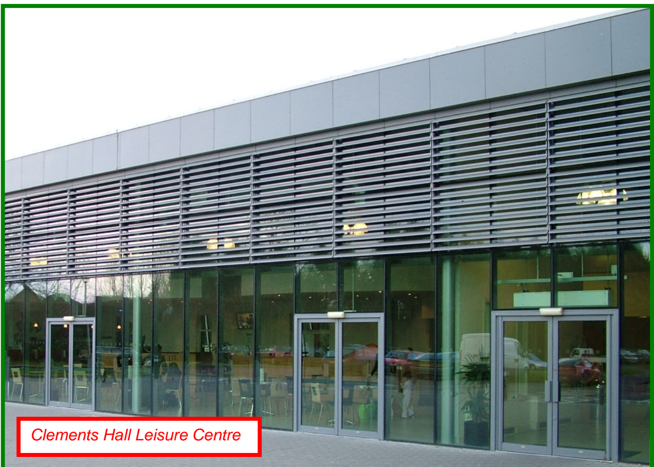
Clements Hall Leisure Centre