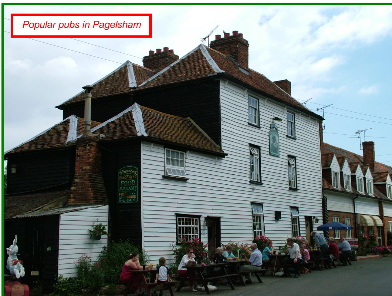
Popular pubs in Pagelsham